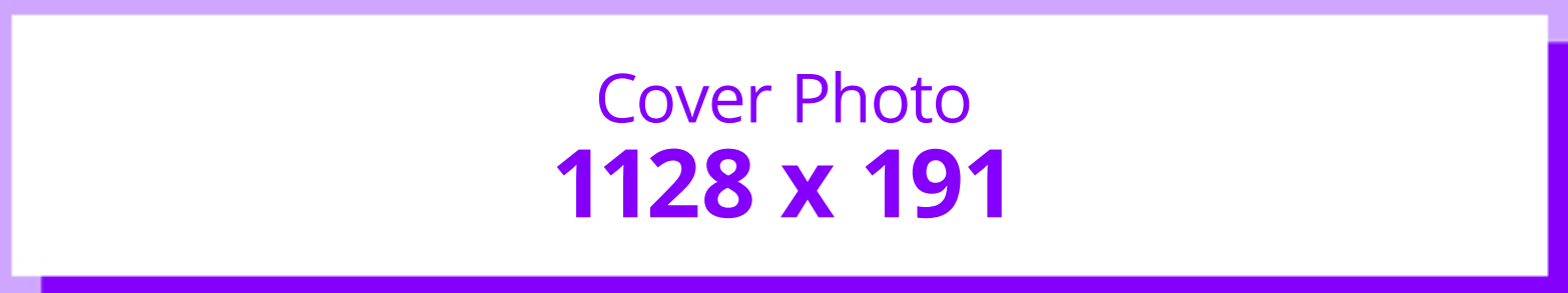
Cover Photo 1128 x 191