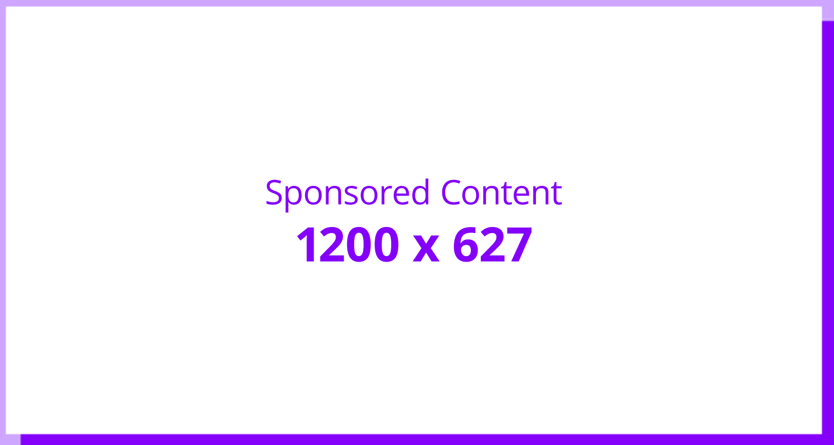
Sponsored Content 1200 x 627