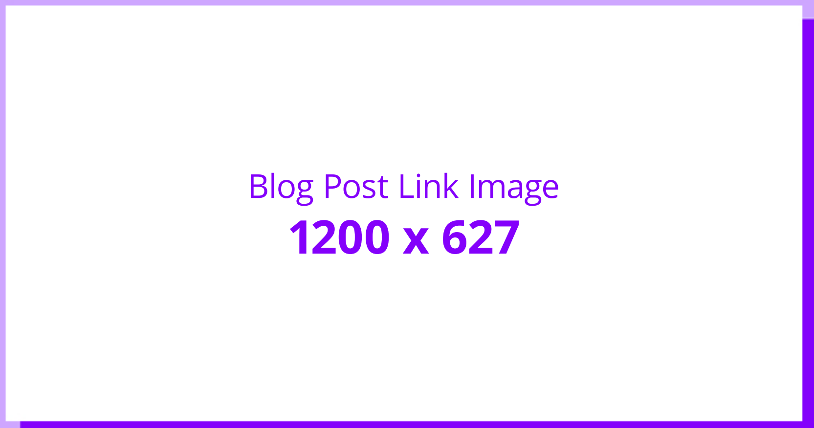
Blog Post Link Image 1200 x 627