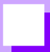
← Dynamic Ads (company logo) 100 x 100