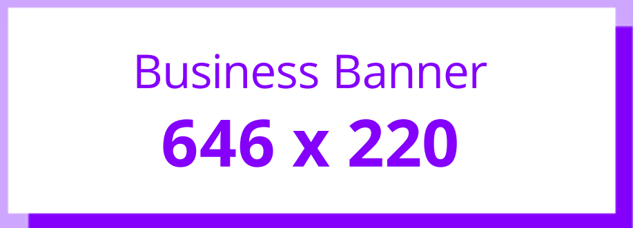
Business Banner 646 x 220